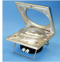
GLOBAL Plus Freestanding