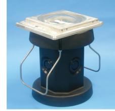
GLOBAL Plus with CABEX