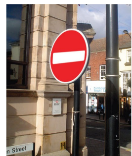
Single sided Invinca