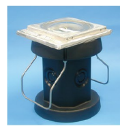
GLOBAL Plus with CABEX