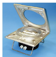
GLOBAL Plus Freestanding