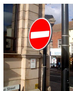
Single sided Invinca